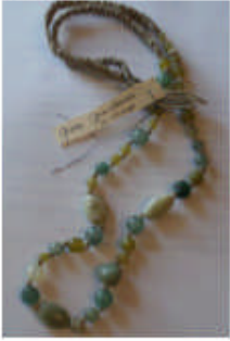
#7 green gemstones hemp crochet 25" $48