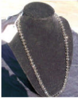
#17 Grey Lead Glass knotted $35