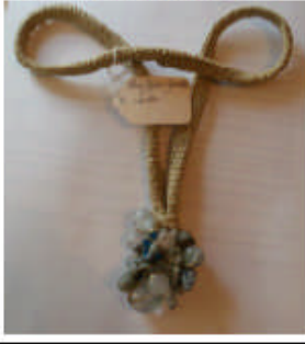
#8 blue green gemstone cluster hemp crochet $65