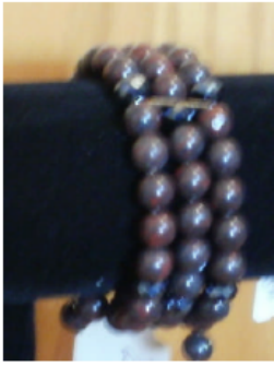
#33 Jasper Gemstone memory wire $20