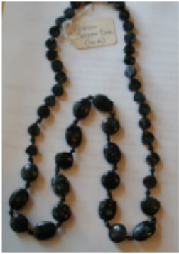
#4 black serpentine 30" knotted $40