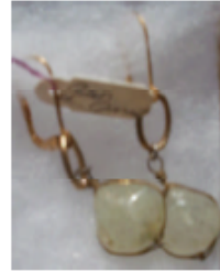
#42 green garnet 1" $18