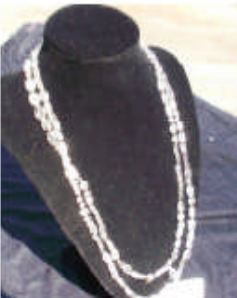
#13 Clear topaz 46" $65