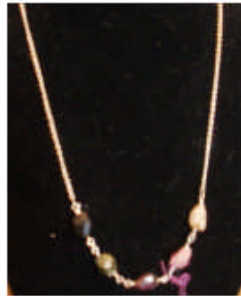
#23 Tourmaline 5 Gemstone sterling $45