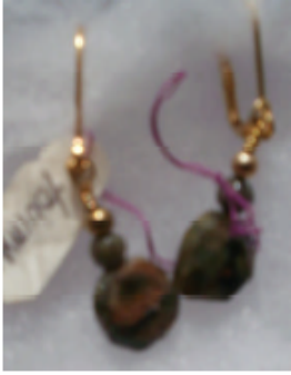
#40 black tourmaline earring $20