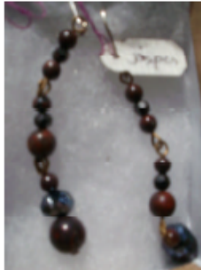
#46 jasper 2" $12