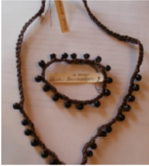
#1 black tourmaline hemp crochet Bracelet $20 Necklace $28