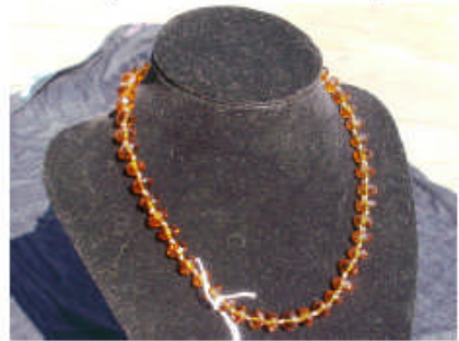
#21 Orange Lead Glass 16" knotted $28