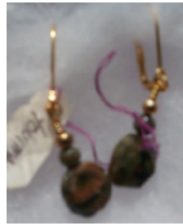
#45 green tourmaline $20