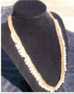
#16 cultured pearl crocheted rope 20" $65