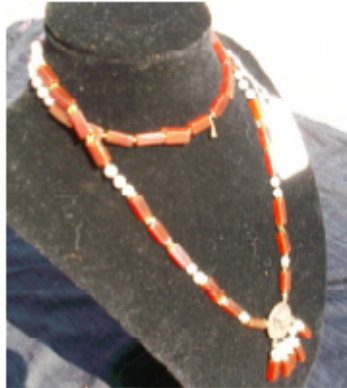
#5 Egyptian Necklace & earring set Carnelian and Amazonite Gemstone $55