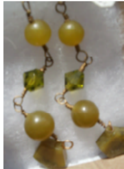
#44 green serpentine crystal 2" $12