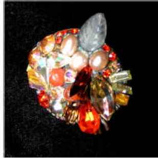
#61 pin $25