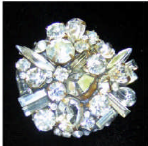
#66 pin $25