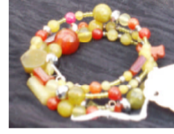
#32 Memory wire Green Serpentine $28