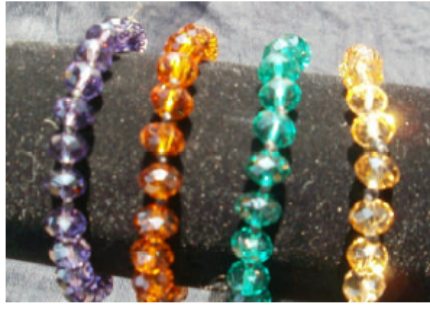
#34 Lead Glass Crystal Bracelet 7" $15 each