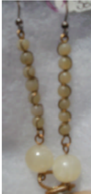
#43 green serpentine 2" $24