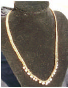
#19 cultured pearl small crocheted rope 20" $20