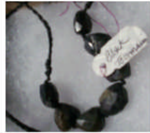
#12 black tourmaline 7 stone 24" $45