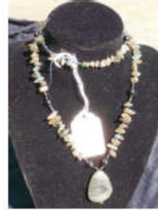
#18 Labradorite black tourmaline 28" $35