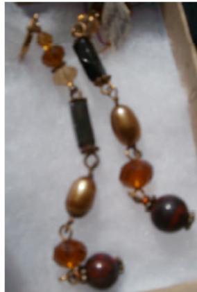
#53 smokey gold pearl earring 2" $12