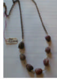
#9 tourmaline 7 stone sterling $65