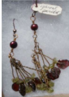
#41 garnet peridot earring $28