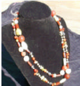
#14 Green Serpentine Red Agate florite 40" knotted $75