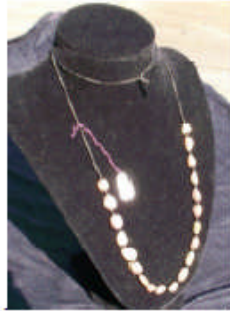
#20 Lt Pink Tourmaline 20 Gemstones $65