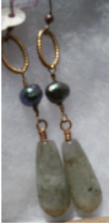
#49 labradorite earring 2" $22