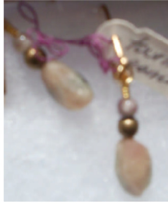
#50 pink tourmaline $20