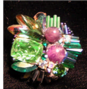
#65 pin $25