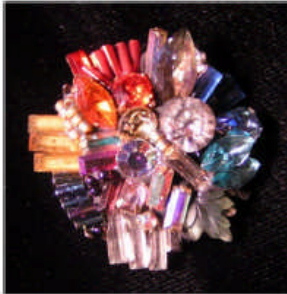
#63 pin $25