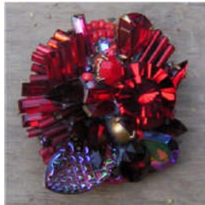
#67 pin $25