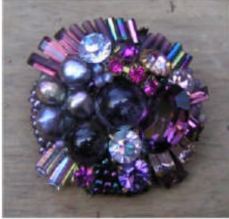
#60 pin $25