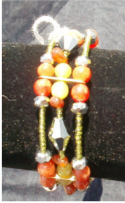
#31 3 Strand Green Serpentine $28