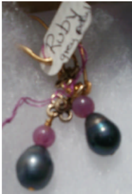
#52 ruby grey pearl $20