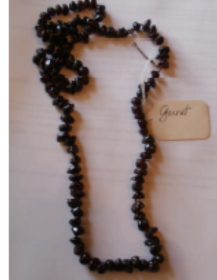
#3 garnet 30" knotted $30