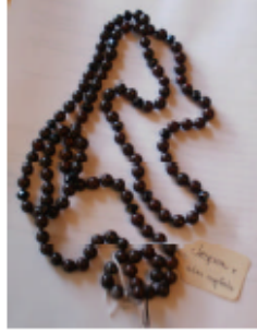
#2 jasper and silver knotted 50" $65