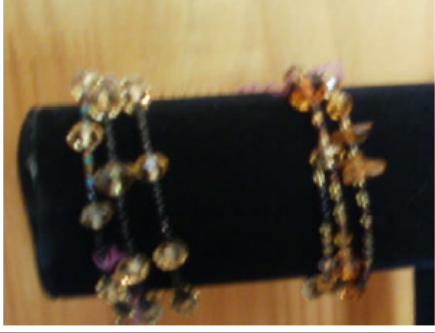
#30 Amber Glass Memory Wire $10