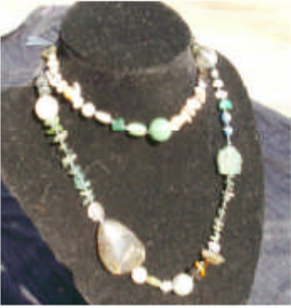
#10 green florite tourmaline labradorite quartz 28" $75