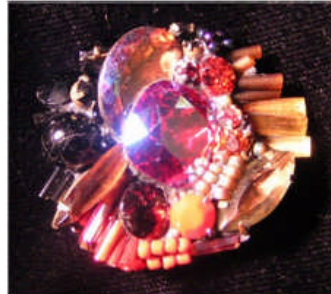
#64 pin $25