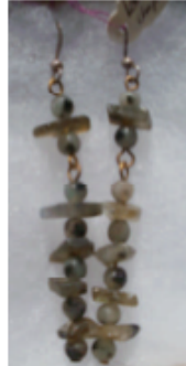
#47 labradorite chips $14