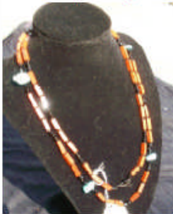
#22 Red Jasper Turquoise 40" $40