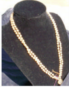
#11 Citrine 40" $45